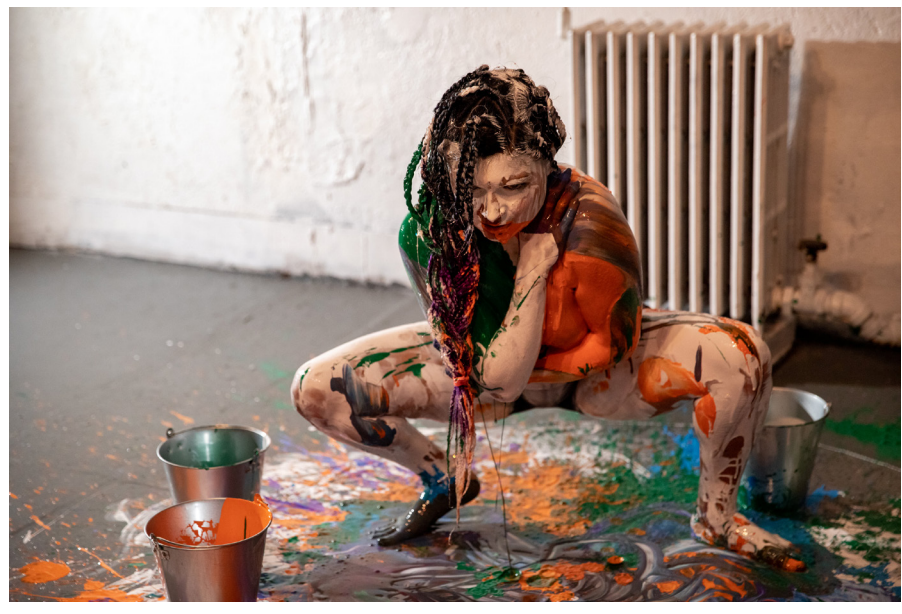
Salome Egas. Reflejo . 2020. Acrylic paint, mirrors, plastic, cardboard, metallic buckets, movement, voice recordings, music. Duration: 10 mins.

happens outside and then communicating beyond our institutions and into the digital space. Protocols should also be mindful of what programming is going online, archived, and what culture is being perpetuated. Is it about numbers, and how many likes and views, or is it about content. Having worked in institutions where the receival of a grant may be based on how many people we reach, rather than who the folks are, which there are no systems in place to gather data on, is difficult. As we build up programs and exhibitions, creativity and patience needs to come into play. For some the hesitation to take on conversations on Zoom, or non familiarity with Instagram Live is real. We must forgive the loss of connection, be patient, and embrace imperfections.