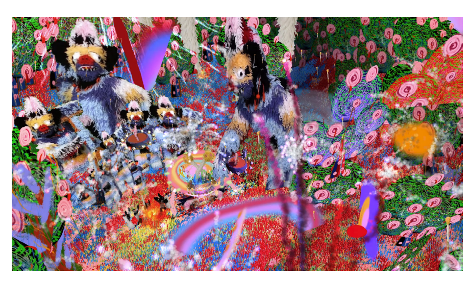
WANG Chen. The Sin Park. 2019. Video still.