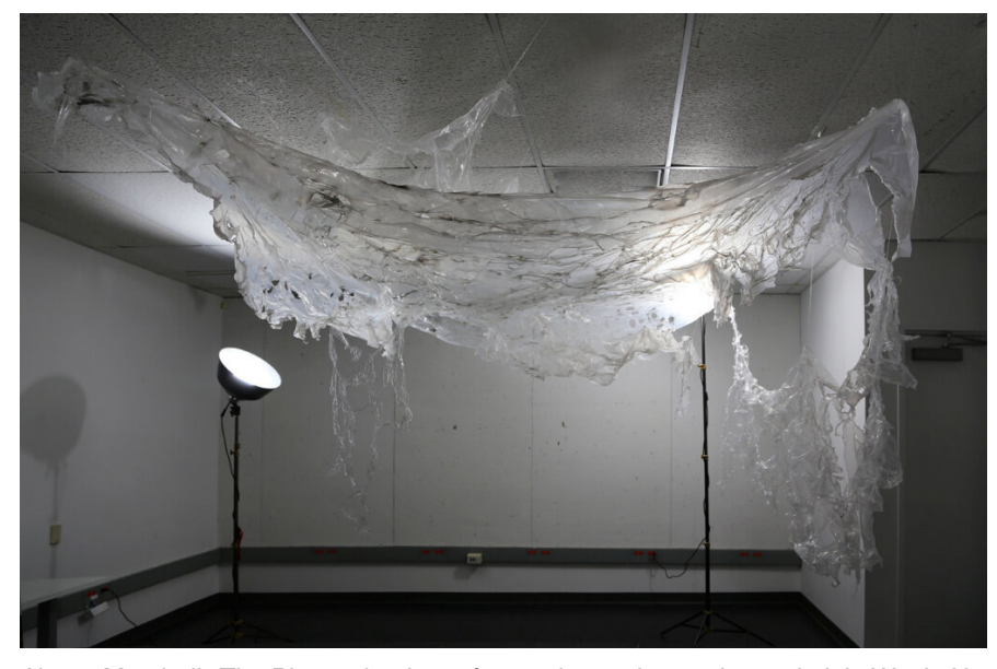
Abena Motaboli. The Pieces that hang far up above - in you, in me, in I, in We, in Us. 2019. Plastic Tarp. Dimensions variable approximate 12ft x 12ft x 12ft.

Someone once told me that in the hesitation of being, we were. Car nous sommes ou nous sommes pas And as I sat - the immigrant - I thought Here were all the things I was ever inspired by The condition of the here, the now, the memory and the being Car nous sommes ou nous sommes pas