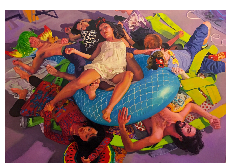
Buket Savci. The Raft. 2019. Oil on canvas, 35 x 50 inches.

Tuesday, November 10, 2020, 6:30pm—8:30pm