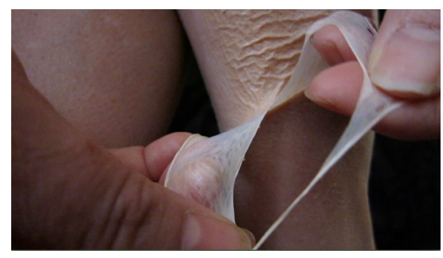
Bianca Falco. Skin/Toxic/Terrae . 2020. 30 minutes.

The work included in "The Imminent Arrival," "Homeland," "Mother Tongue," and the accompanying performance program pushes back against American cultural imperialism while suggesting that a